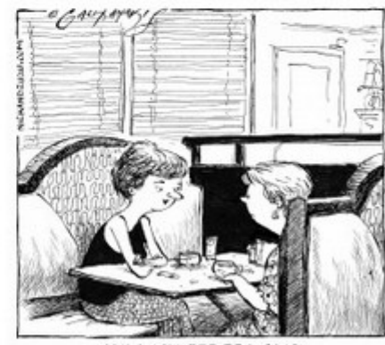
40U LOOK PRETTY GOOD FOR A CAUTIONARY TALE.