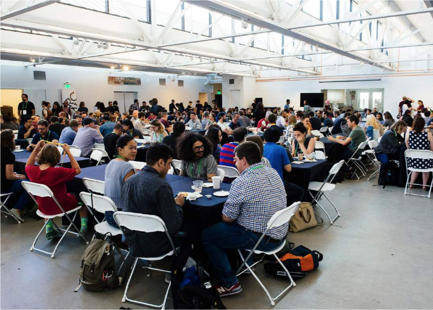
Bustling meal time at SRCCON 2016