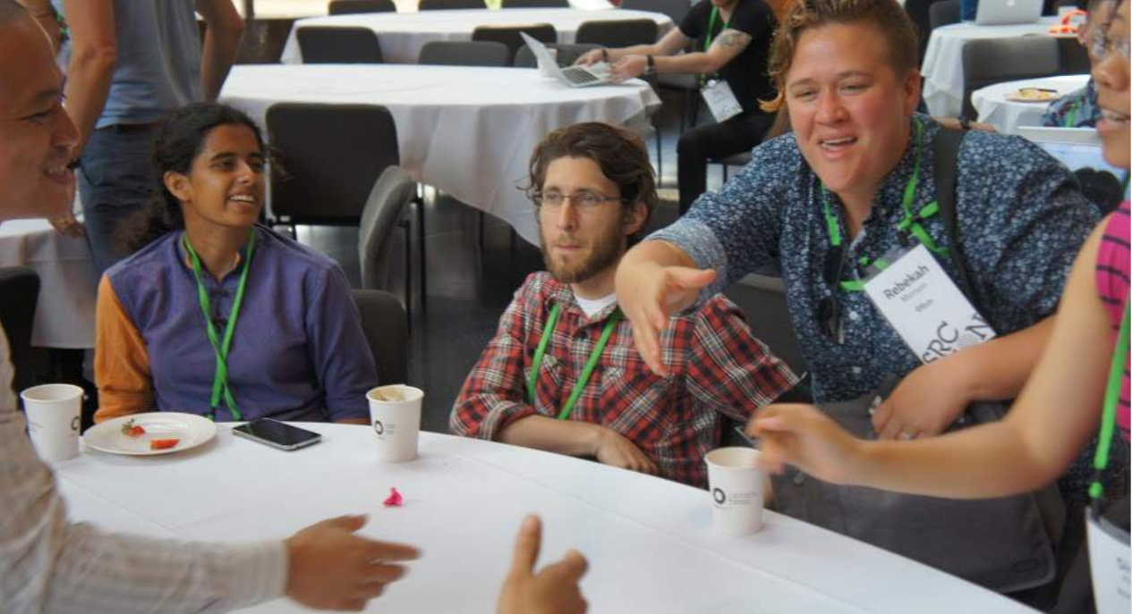
The welcoming community at SRCCON