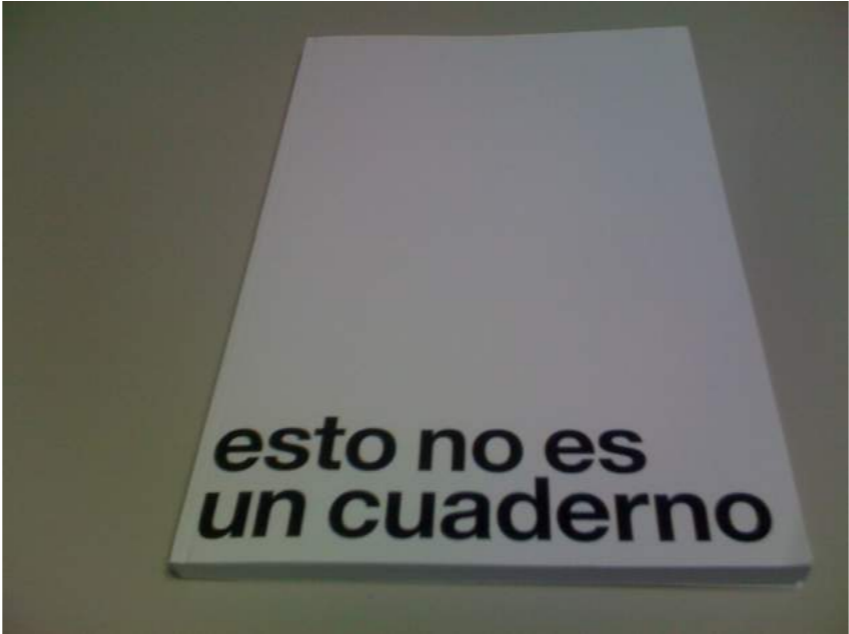
This is not a notebook.